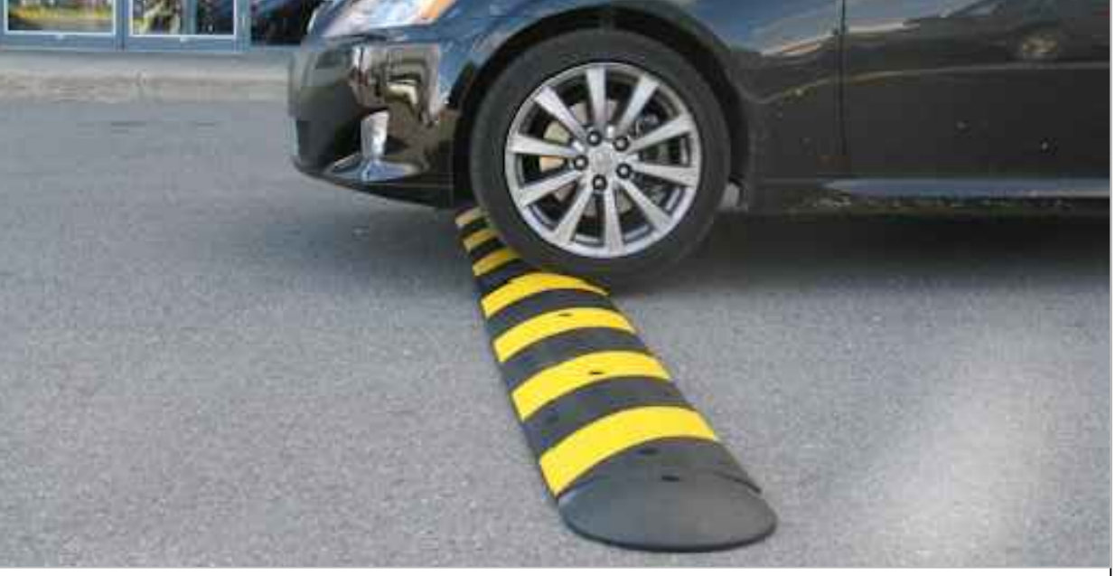
Proprietary speed bump fixed to road surface MARKED AS "SB"