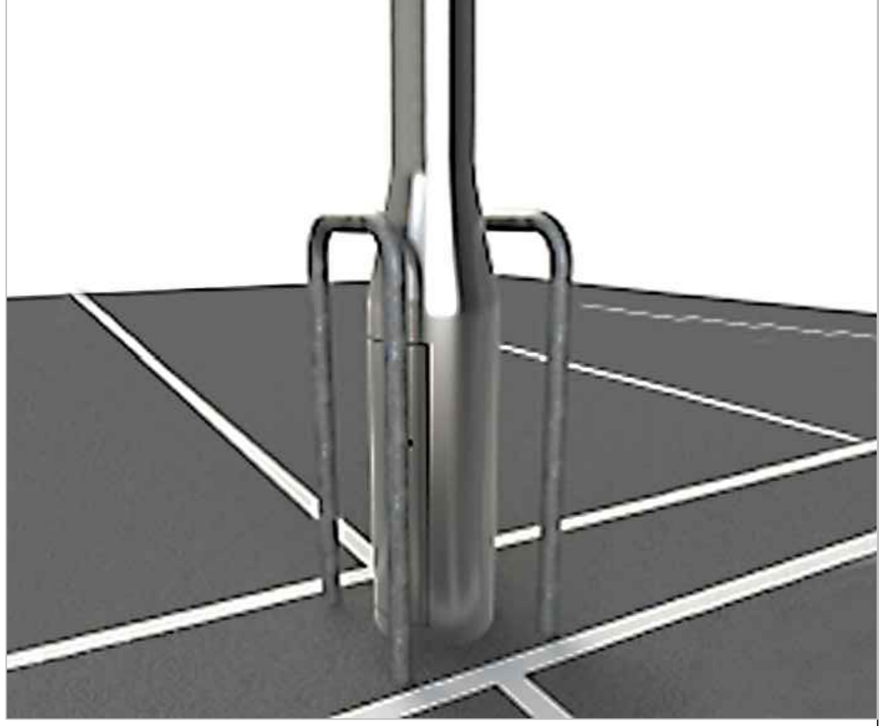
Street Lighting Column With Vehicle Protection Barrier MARKED AS "LP"