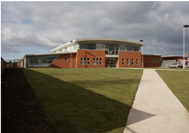
Skerne Park Primary School Darlington