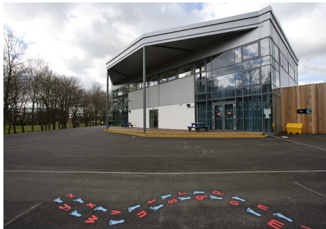
Harrowgate Hill Primary School Darlington