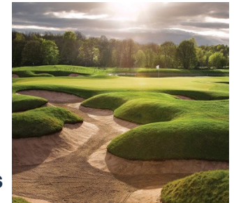
Rockliffe Hall won the Large Hotel of the Year at the Visit England Awards for Excellence 2012 and North East Tourism 'Large Hotel of the Year' 2011