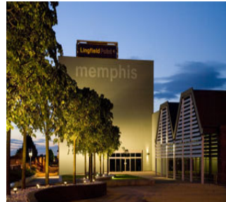
In 2009 Memphis won the 'Refurbished/Recycled Workplace' category at the British Council for Offices (BCO) Northern Awards and received the 'Commercial' award at the RICS North East Renaissance Awards