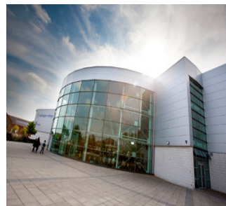
Darlington College and Teesside University have moved onto Central Park providing high quality higher education facilities