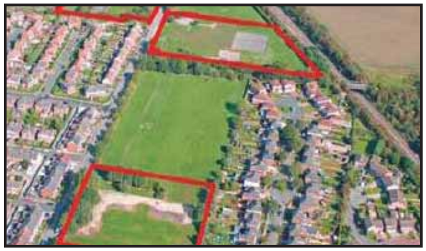
Former Beaumont Hill School Site