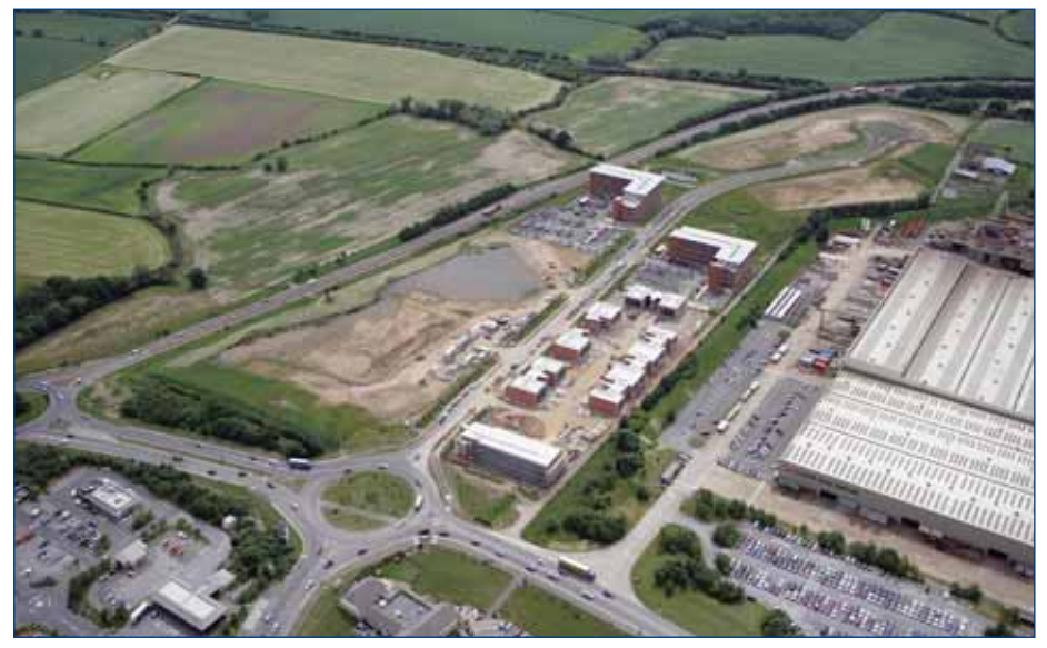
Arial view of Morton Palms Development area