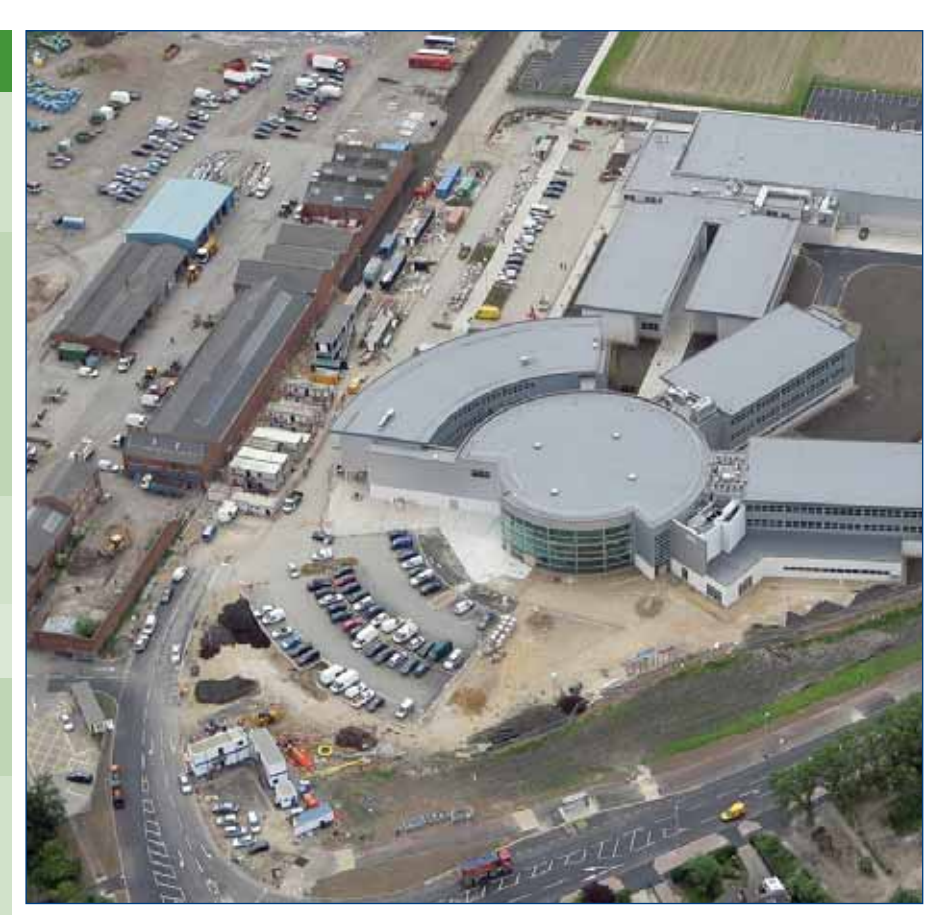
Aerial picture of entrance to Central Park and Darlington College