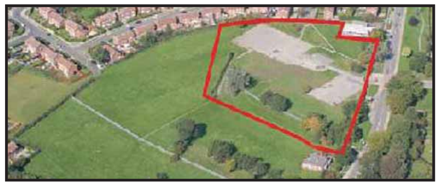
Former Springfield School Site