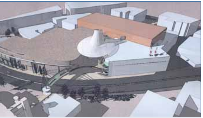
Commercial Street Development