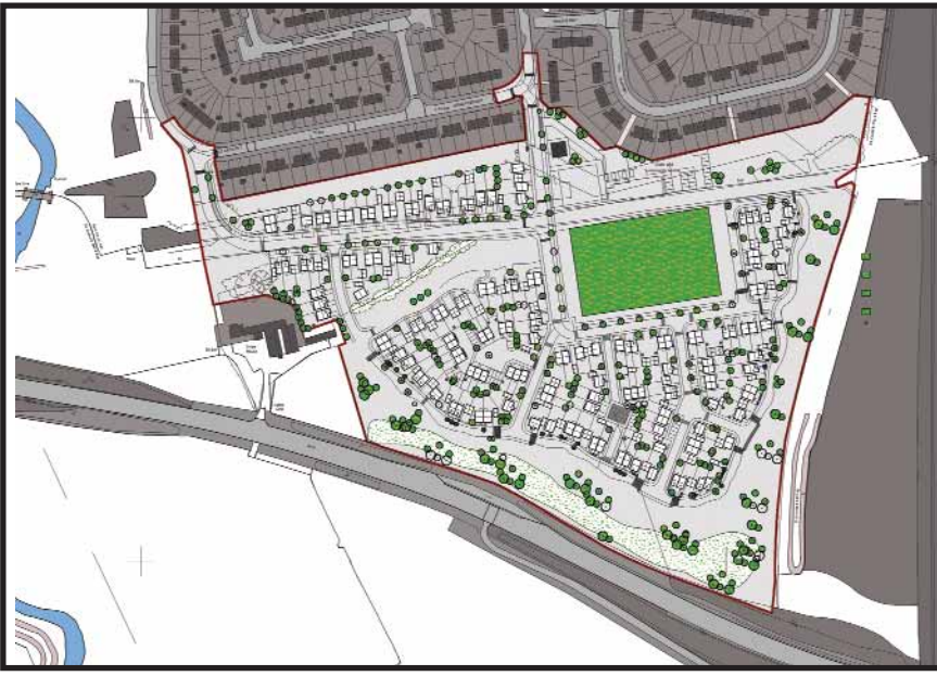
Proposed Miller Homes Scheme, Snipe House Farm