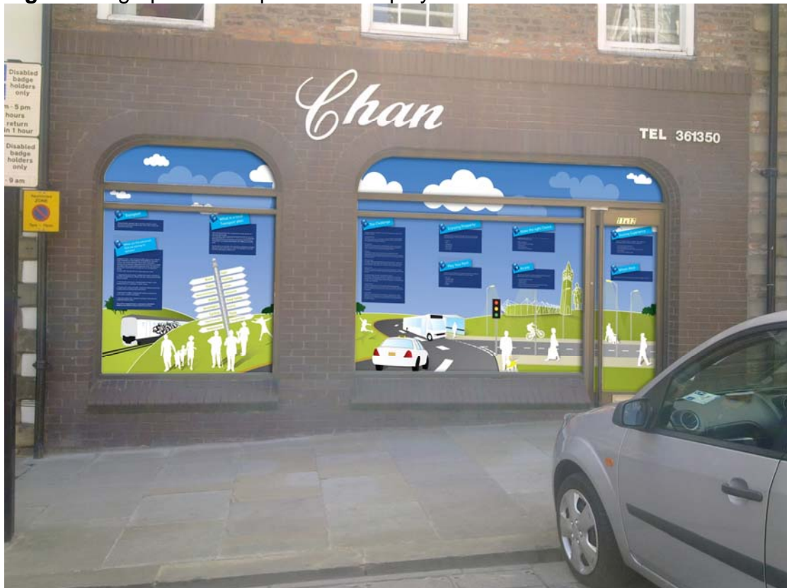
Figure 3 – graphic of shop window display

Promoted via an article in the Town Crier, press release and a shop window display (Figure 3)