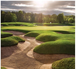
Rockliffe Hall won the Large Hotel of the Year at the Visit England Awards for Excellence 2012 and North East Tourism 'Large Hotel of the Year' 2011

• Cinema, hotel and restaurant complex on the Feethams site to be built by 2014.