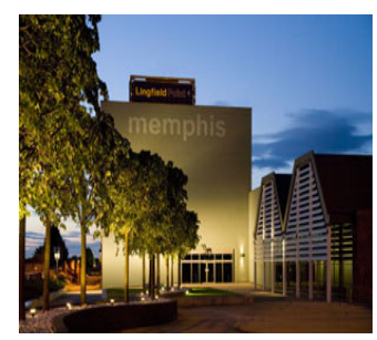
In 2009 Memphis won the 'Refurbished/Recycled Workplace' category at the British Council for Offices (BCO) Northern Awards and received the 'Commercial' award at the RICS North East Renaissance Awards