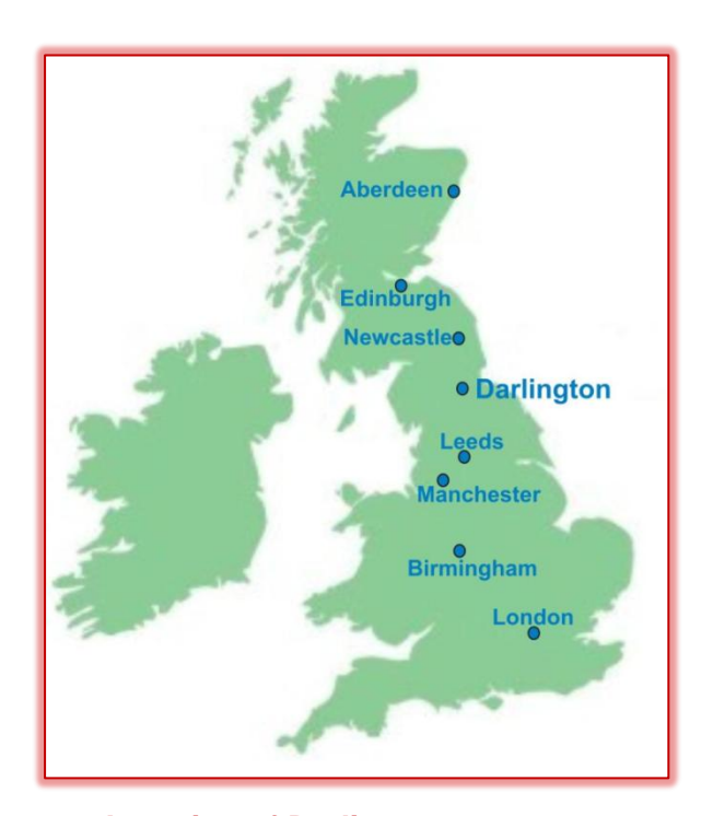
Location of Darlington