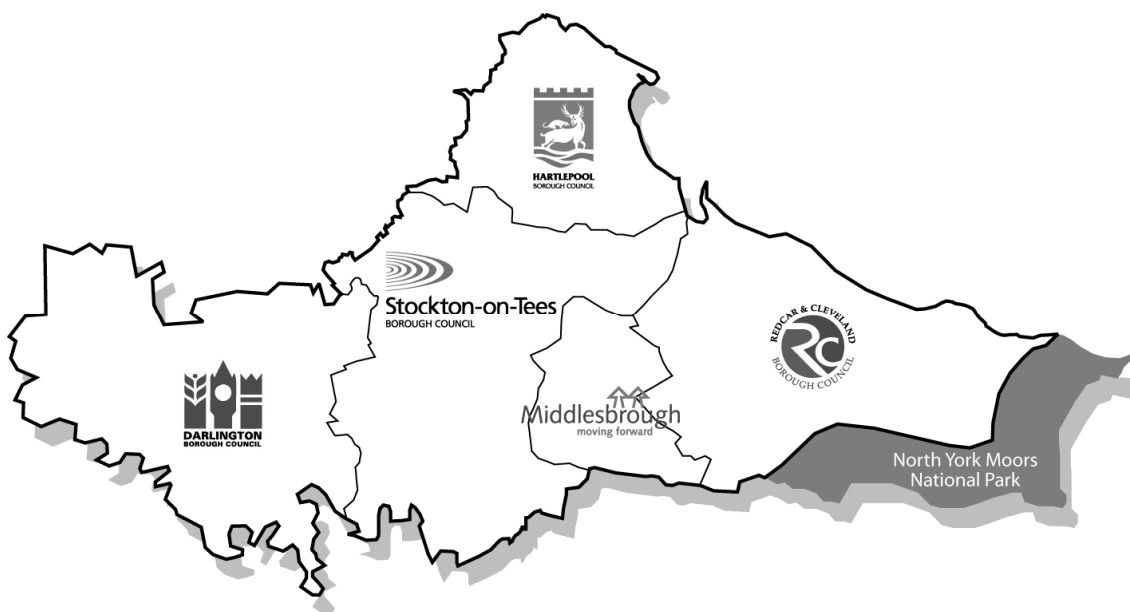
Figure 1 The Tees Valley