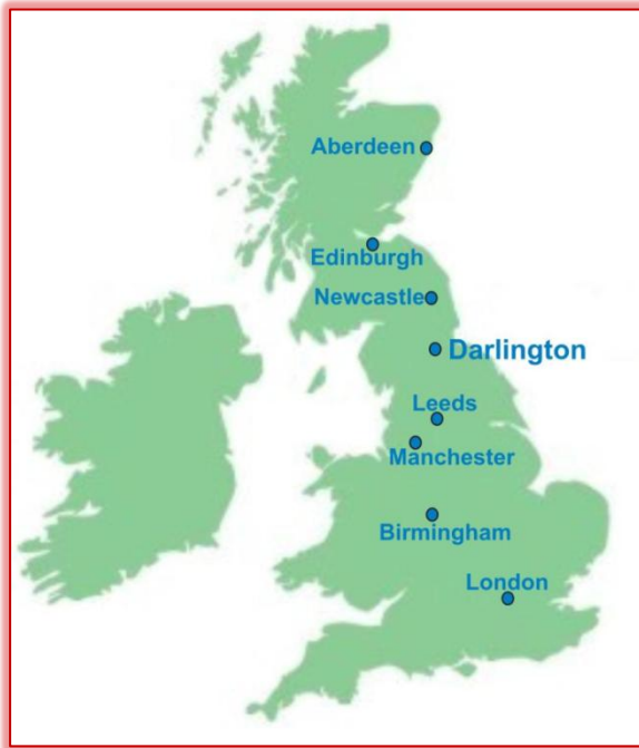
Location of Darlington