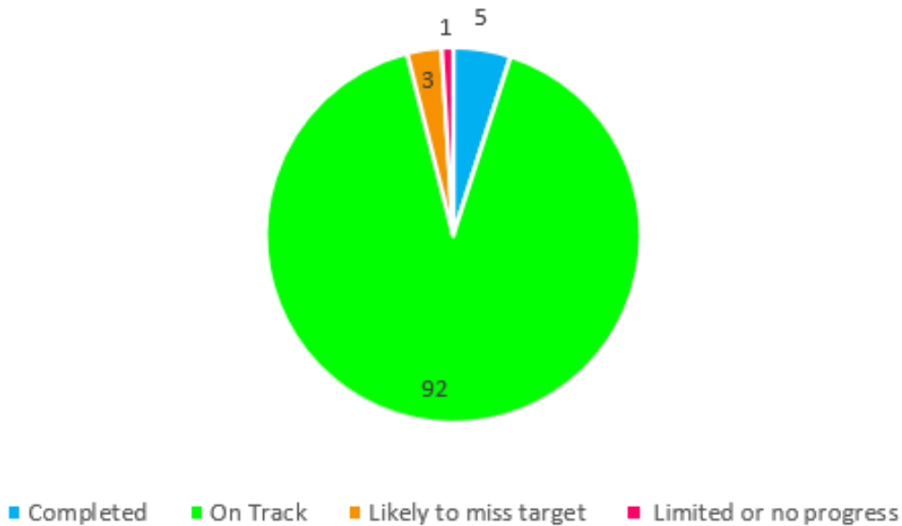
Climate Action Points Status Q3 2024 (Total 101)